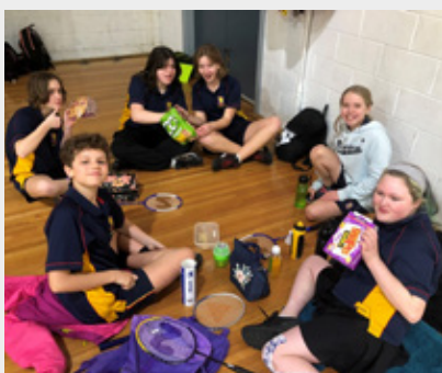
The team relaxing between matches.