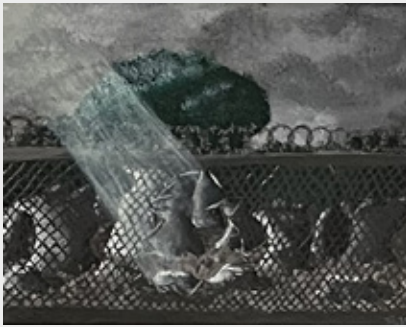
Lydia Green's 'Escape The Pain'