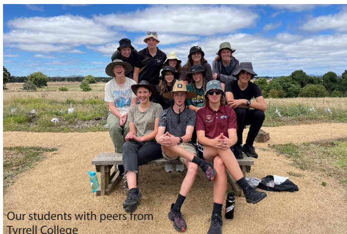
Our students with peers from Tyrrell College